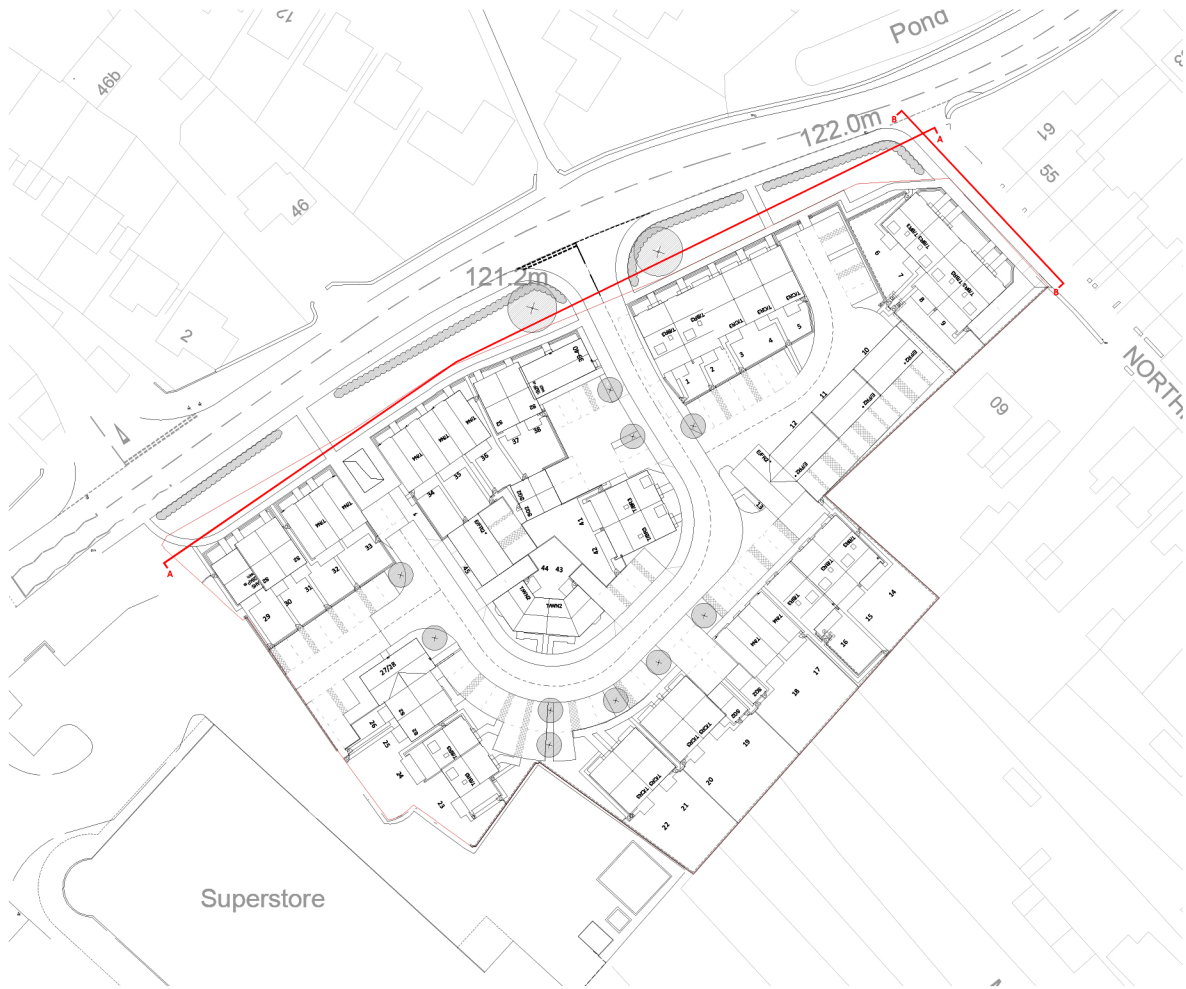
KEY PLAN :NTS